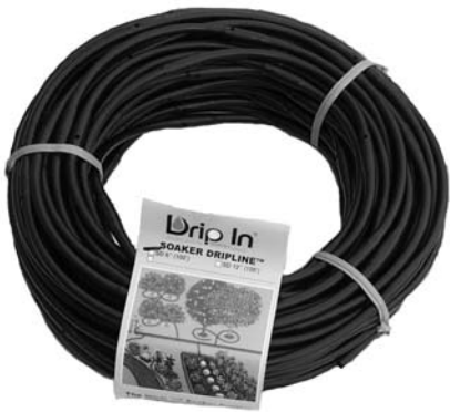
(1) DSD12- 100' roll (12" Spacing, ½ GPH/emitter)

This is micro irrigation at its easiest for window boxes, planters, irregularly shaped areas, raised beds or row crops. Kit Includes: